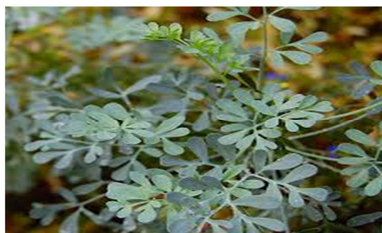
Fig. 2. R. graveolens growing plant