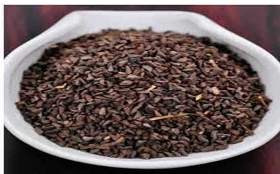
Fig. 1. Ruta graveolens (Rue) seeds

The R. graveolens L. is an evergreen, hardy, shrub, going around one-meter-tall, greyish in colour and having keen and unpleasant odour in leaves and remified stem. Leaves of the plant are small, oblong, deeply divided, pinnate and glandular dotted. Flowers are yellow, small (13 mm) and present in clusters and blossoms in the summer and spring. Flowers have four petals and the central flower has a total of five petals. The fruit is small, round and 4-5 lobulated.