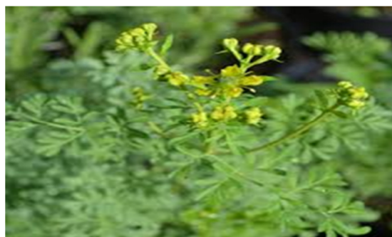
Fig. 3. Garden rue at flower initiation stage